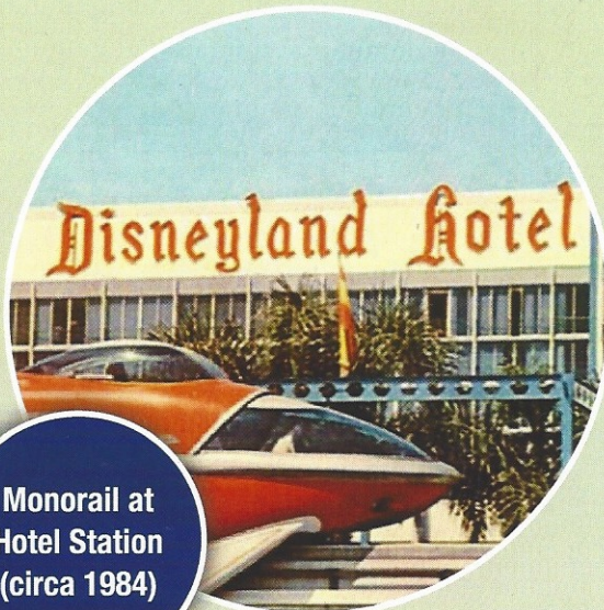
Monorail at Hotel Station (circa 1984)

With the opening of the Downtown Disney District in 2001 the old Hotel Station was demolished and re-opened as the new Downtown Disney Monorail Station. This new station opened up the new Resort area to Guests visiting the Park who wished to visit the high energy shopping, dining, and entertainment district. Also opening on February 8, 2001 was Disney's California Adventure. The monorails now traversed from Tomorrowland through the